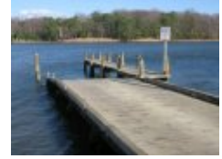
The LPIA Boat Ramp

The community boat ramp is located at the end of Cornfield Creed Road by Twin Beach Road. It is available for use by all residents, but you must be registered to use it, and you must be a current member of the Long Point Improvement Association also.