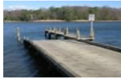
Long Point Boat Ramp

PAYMENTS DUE: This year, we are accepting credit cards and checks, NO CASH. You may pre-pay on Paypal (see link below). Please be prepared to pay Membership dues ($65/ family or $40/ senior, if you haven't already) and your Boat Ramp dues ($75 per key, $25 for additional stickers.)